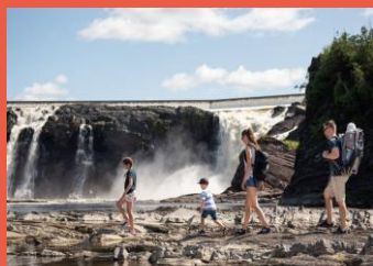
Parc des Chutes-de-la-Chaudière