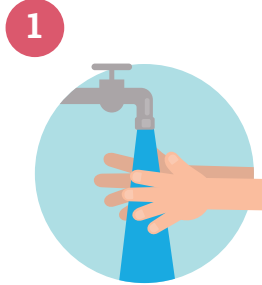
1 Wet your hands