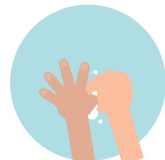
Your thumbs and the tips of your fingers