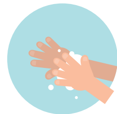
The backs of your hands