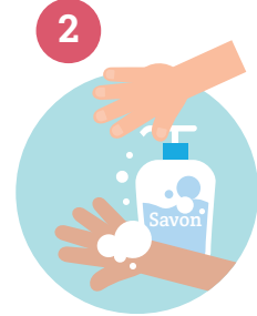
2 Apply soap