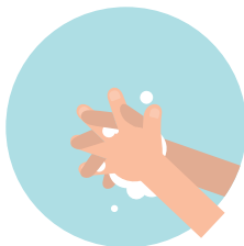
Between your fingers