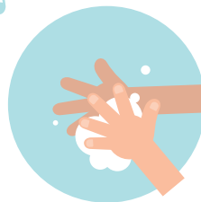
The palms of your hands